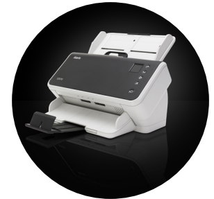
Alaris S2050/S2070 Scanners