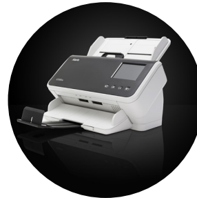
Alaris S2060w/S2080w Scanners