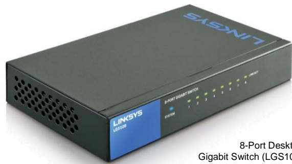
8-Port Desktop Gigabit Switch (LGS108)