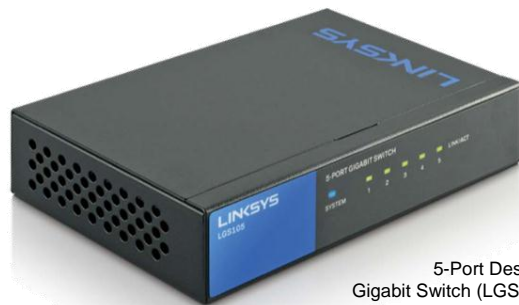
5-Port Desktop Gigabit Switch (LGS105)