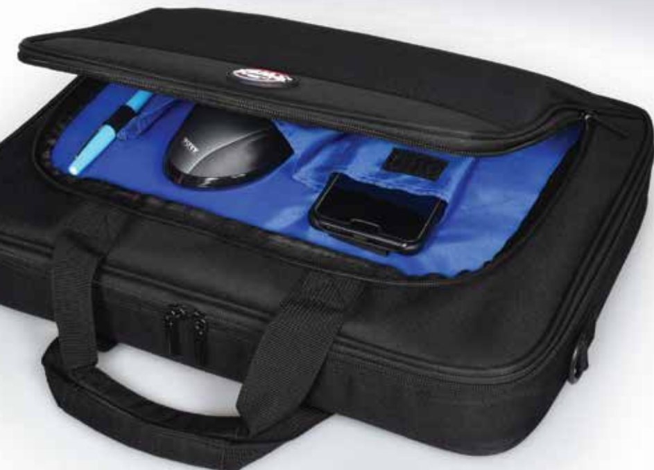
Large front pocket with organizer Grande poche avant avec organisateur