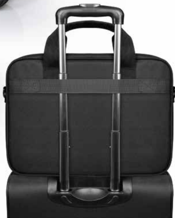
Trolley strap and removable & adjustable shoulder strap Sangle pour trolley et sangle de transport amovible & ajustable

Photos submit to change/Photos non contractuelles