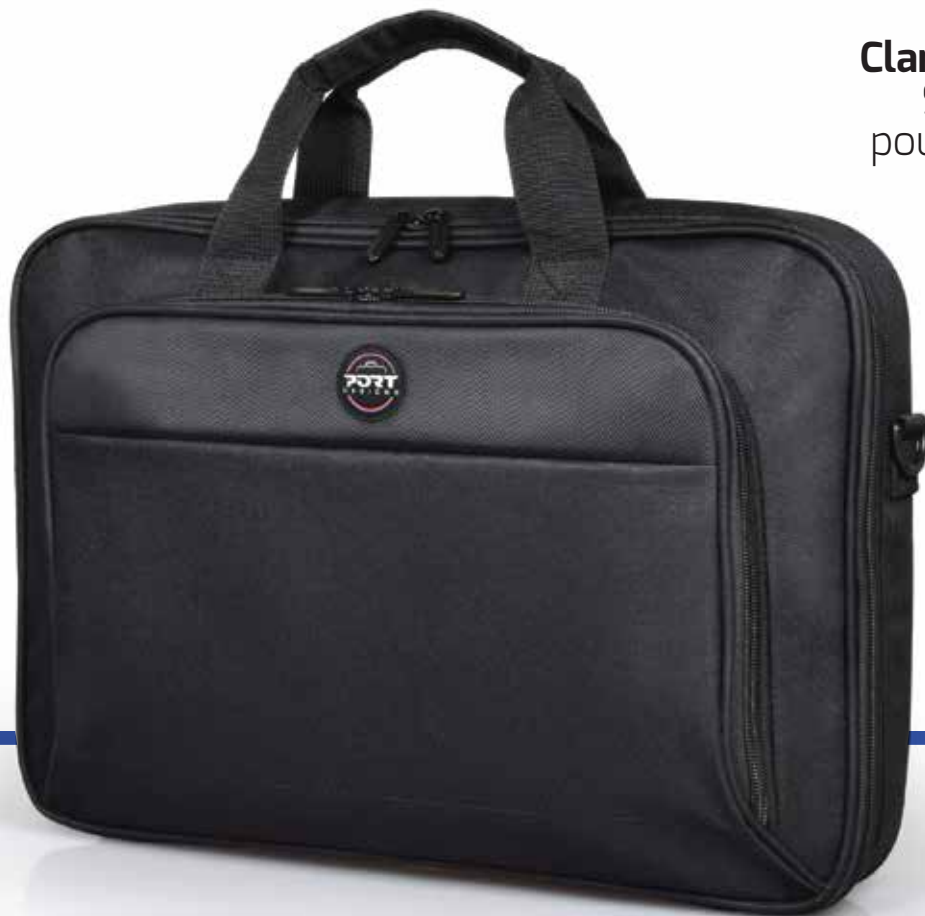
Clamshell notebook case Sacoche clamshell pour ordinateur portable